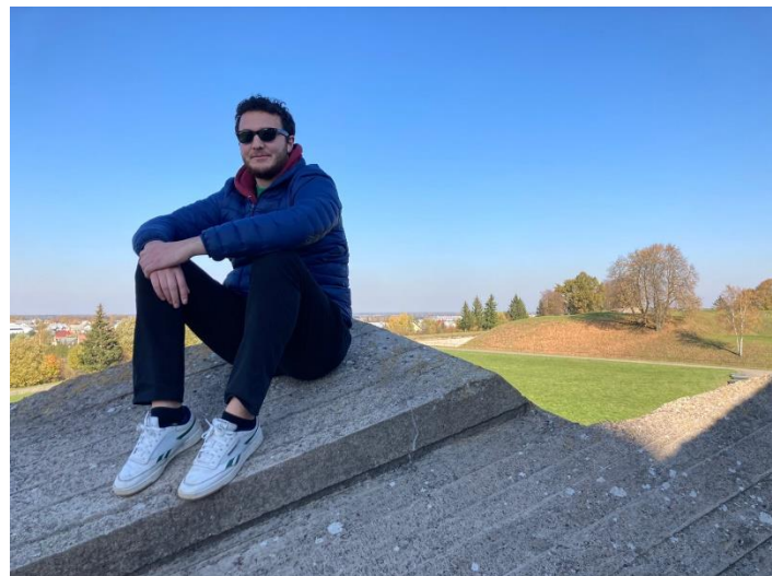
Discovering the best nature spots of Lithuania