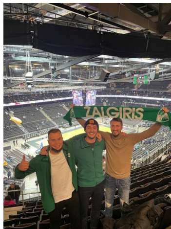
We Are the Champions!