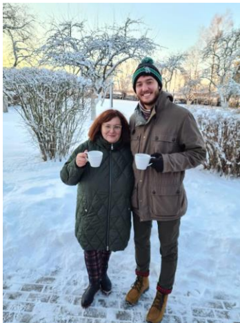
Enjoying white Christmas in the Lithuanian countryside