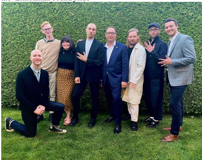
Meeting the famous people of Lithuania