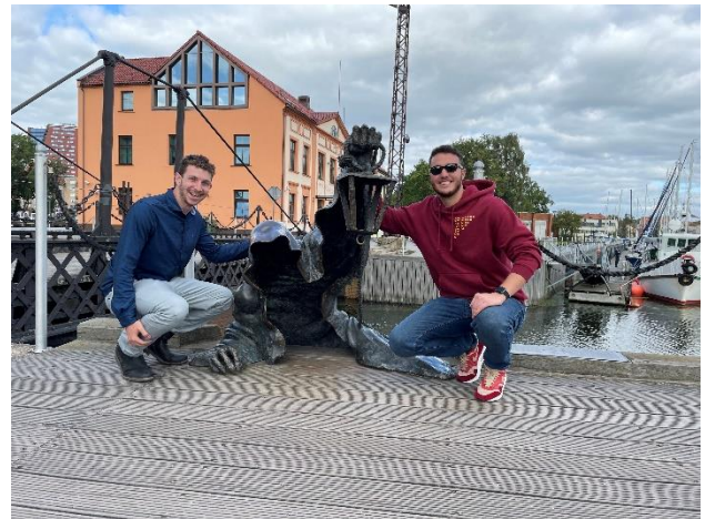
The Fulbrighters - friends forever!